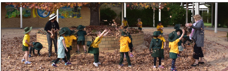
Having fun under the 'Magic Tree'.