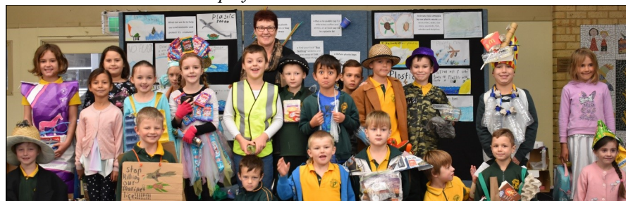
Great entertainment from Room 3