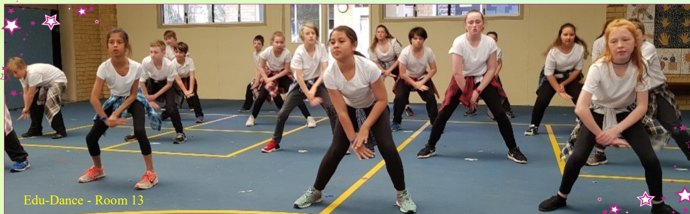
Edu-Dance - Room 13

Term three concluded with some amazing events, with the athletics carnival, Edu-dance concert and an absolutely awesome Room 14 assembly, all in the last three weeks of the term. Well done staff and students for a mighty effort.