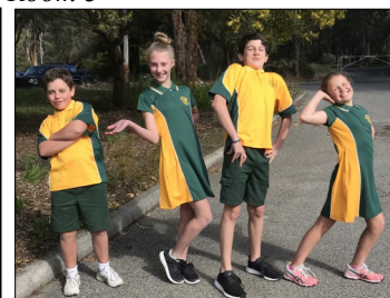
Our stunning new uniforms