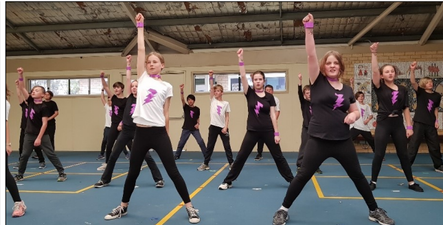
Fabulous Edu-Dance performers