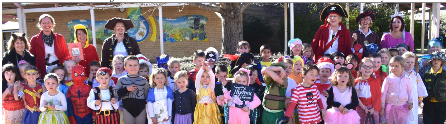
Celebrating Book Week with the ECC