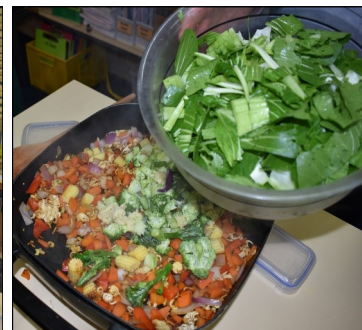
Cooking (and eating) from the vegie garden in Room 13