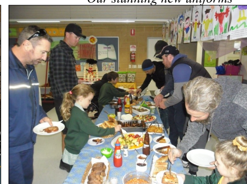
ECC Dad's breakfast