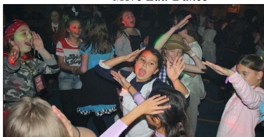
Lots of fun at the P&C Disco